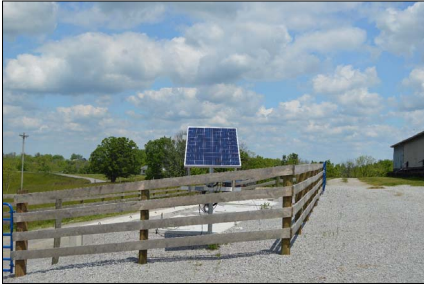
A solar powered pump installed in a water harvesting system.

Definition: The practice of using a solar panel and pump to distribute water within a water harvesting system. This practice includes the infrastructure necessary to direct, store, and distribute water. This practice is supported by NRCS practice standard codes 570: Stormwater Runoff Control, 614: Watering Facility, and 636: Water Harvesting Catchment. This practice is eligible for cost share through CAIP and EQIP in Kentucky.