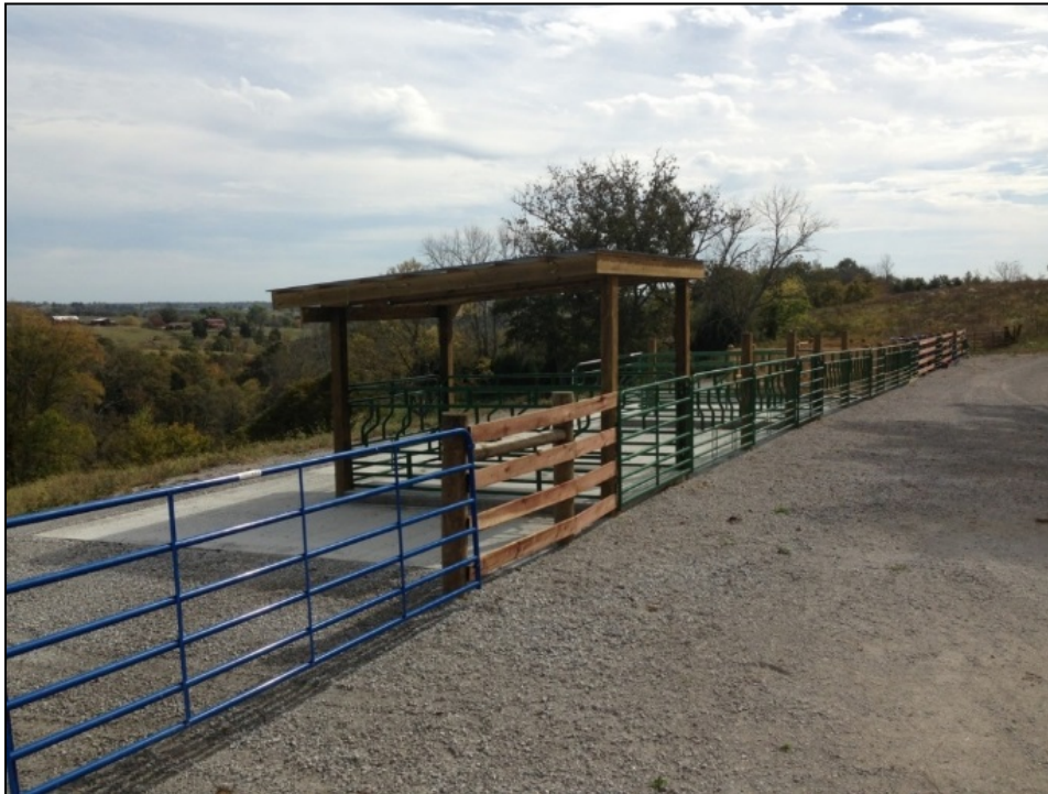
Fenceline Feeding System demonstration site at Eden Shale Farm

Definition: The practice of installing livestock feeding structures into strategically selected fencelines in close proximity to feedstuff storage facilities. This practice is supported by NRCS practice standard codes 382: Fence and 561: Heavy Use Area Protection. This practice is soon to be eligible for cost share through CAIP and EQIP in Kentucky.